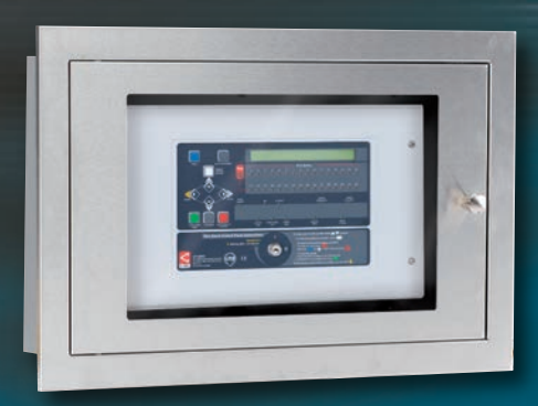
Stainless steel enclosure