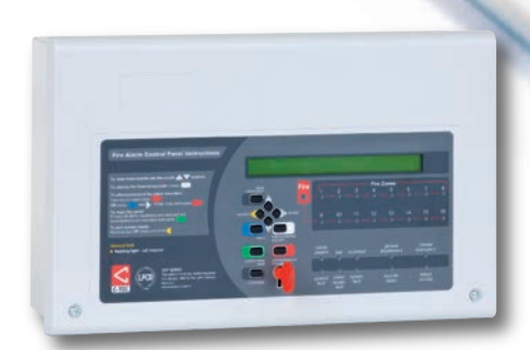
XFP single loop 16 zone panel