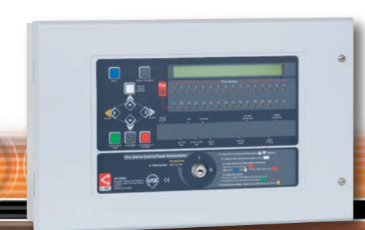
XFP 1 or 2 loop 32 zone panel